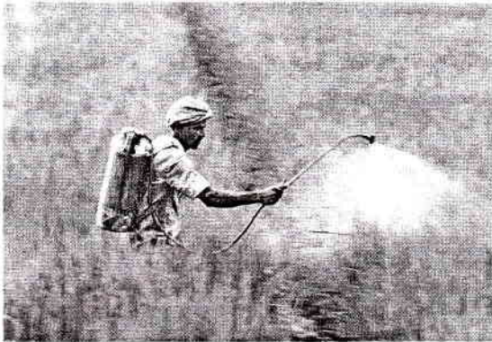
Fig.6. Lever operated Knapsack sprayer is being used in the rice field

The analysis indicated that training, using protection measures, over used of pesticides and number of exposures were significantly associated with the probability of farmers' health impairment from pesticides use. However, the other variables such as AI, categories of hazards, education, training on IPM, body index, age and income had no statistically significance on the impact on health.